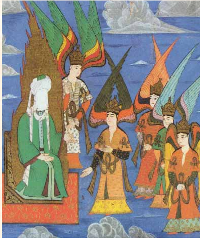
The Prophet Muhammad in the company of the angels

Rūmī also, although living after Ibn ‘Arabī, follows the earlier terminology in his writings. Discussing the true nature of man, Rūmī remarks that philosophers say that man is the microcosm, while theosophers or Sufis say that man is the macrocosm,